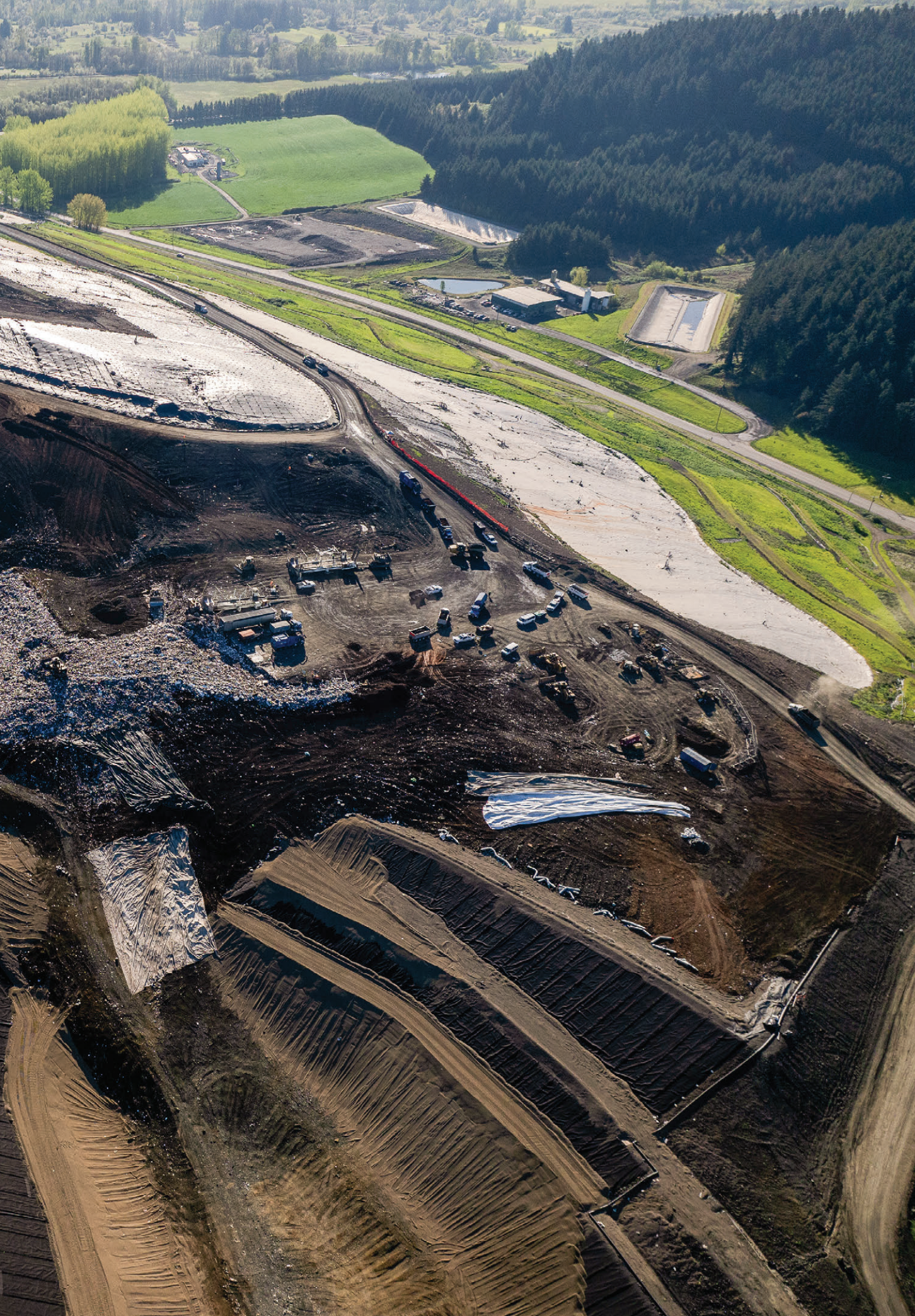
■ The Coffin Butte Landfill, located near the community of Soap Creek in Oregon's Willamette Valley, takes in nearly a third of the state's trash.