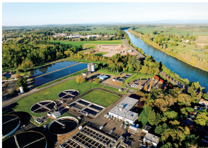
■ The Willamette River flows past the Corvallis Wastewater Reclamation Plant.